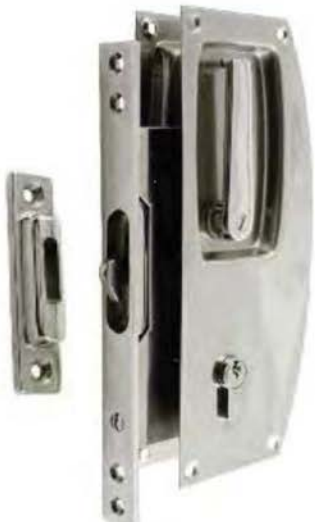
#18.3786 SET Entry Sliding door lock with Profile cylinder and strike box Min. door thickness: 38 mm or 1 1/2 inch