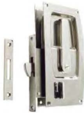
#18.3838 Privacy Sliding Door lock with strike plate min. door thickness: 25 mm