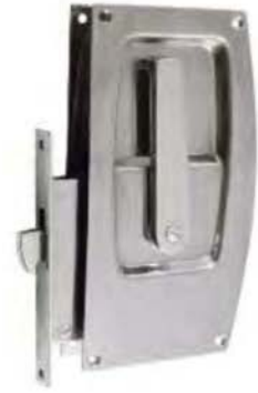
#18.3796 Passage Sliding door lock with strike plate min. door thickness: 25 mm