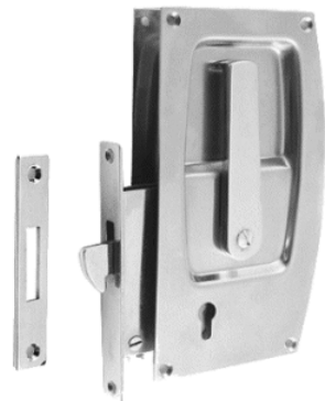
Entry set #18.3448 With skeleton keys (2X) Minimum Door thickness 25 mm or 1 inch

R & C SWINGING DOOR LOCKS SEE PAGE I-13-C-B: