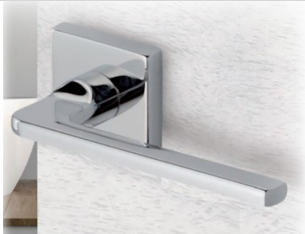
LEVER: #15.0119 "Q-10"