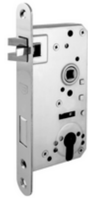
55 mm backset Doorthickness: 1 ½ inch